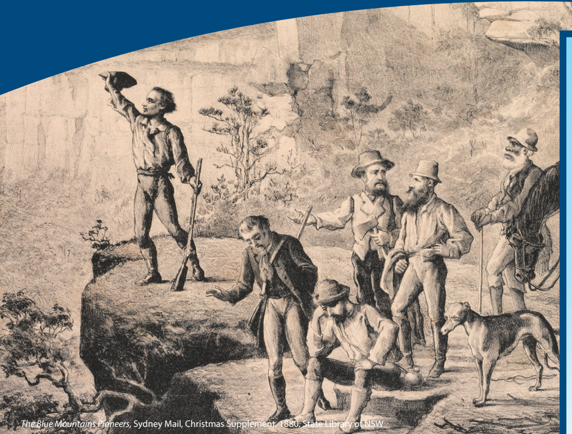
The Blue Mountains Pioneers, Sydney Mail, Christmas Supplement, 1880, State Library of NSW